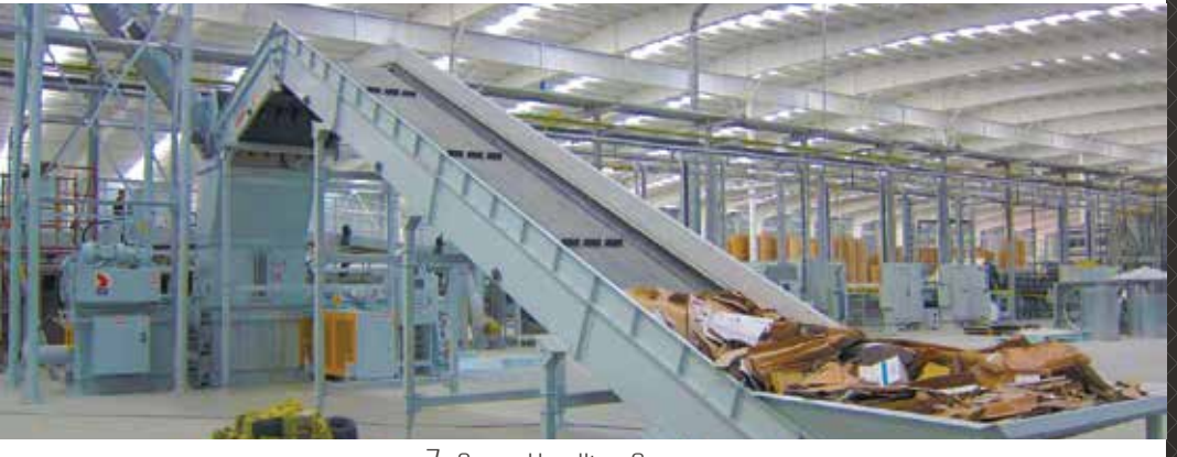
7 Scrap Handling Conveyors