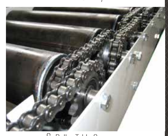
6 Roller Table Conveyors