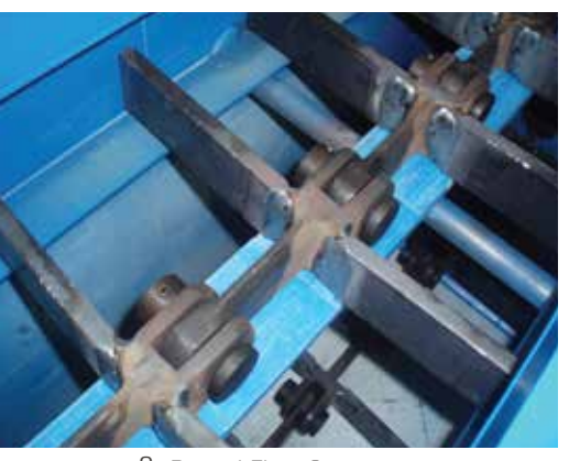
3 Drag / Flow Conveyors