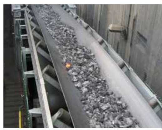
4 Belt Conveyors