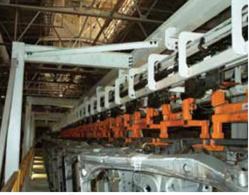
5 Overhead Conveyors