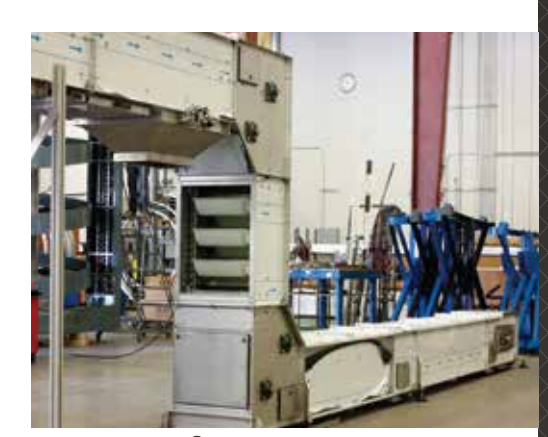
2 Bucket Elevators